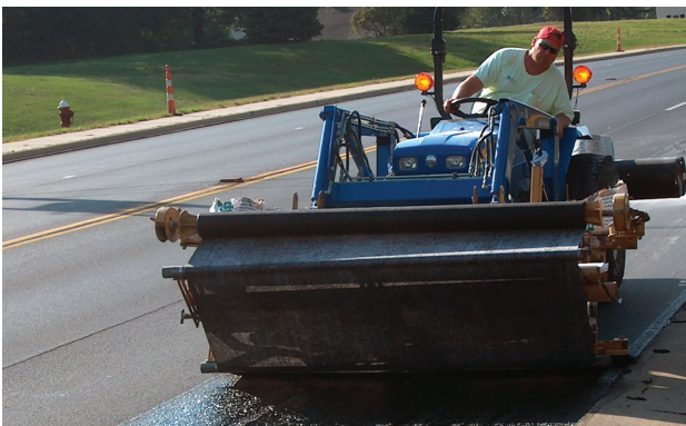
The GlasPave 50 wide-width rolls allow faster installation that can result in a savings on labor costs.

THE CHALLENGE: Due to reflective cracking, concrete streets with asphalt overlays tend to have a short service life, 10 years or less, and expensive pavement maintenance afterwards. The challenge was to increase the life cycle of resurfaced streets and decrease the maintenance costs by reducing the number of joint repairs, reinforcing the resurfaced asphalt and waterproofing the pavement. The City of Westlake's 20-foot wide concrete streets featured centerline and transverse joints every 25 feet that were randomly failing.